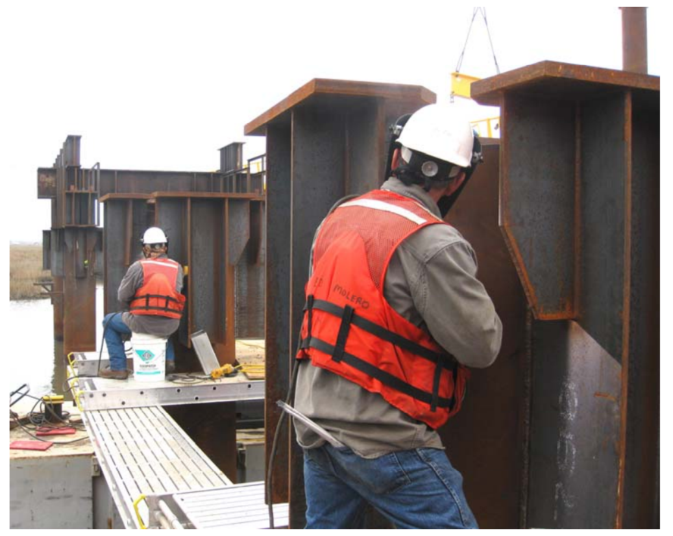
Construction workers at the IHNC Surge Barrier wear their PPE while working on steel piles. Since this job site is over water, the workers are required to wear flotation safety vests.

Construction workers on all USACE work sites are required to wear PPE: hard hats, steel-toed boots, gloves, reflective vest, goggles (eye protection) and, depending on location, a floatation safety vest.